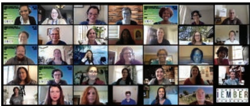
2020 Virtual iEMBER Conference: Researching Institutional Racism and White Privilege in STEM Education

The work of the iEMBER network is supported by NSF grant #2010716