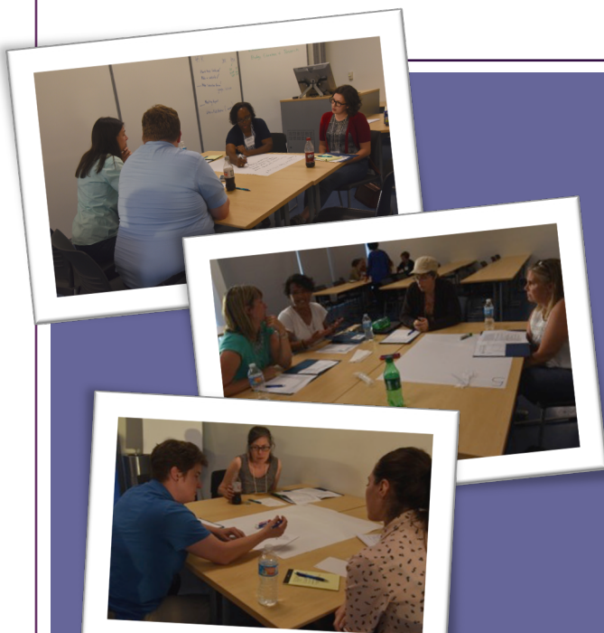
iEMBER 2017 Pitch Proposal Session

Travel stipends from our current RCN-UBE grant are available to any iEMBER member wishing to participate in these activities and will be given on a first-come, first serve basis, email marcettj@hssu.edu for details.